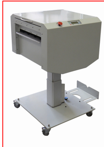
Single image of the Velox 8 sealer