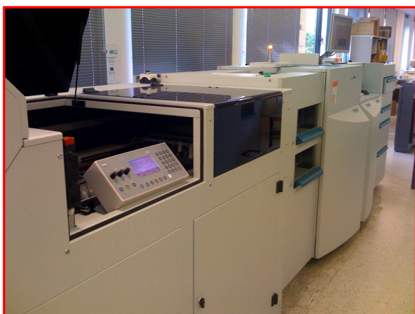
Single sheet-digital printing system with turning station Ti90

The special protective covers around the entire system are difficult to open and screen it from view. A software which registers and captures when and where the protective covers were opened ensures a constant monitoring.