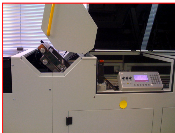
MB-System CAS 52/4