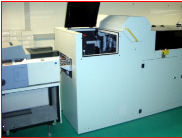
MB-System CAS 52/4 with Velox 8 sealer