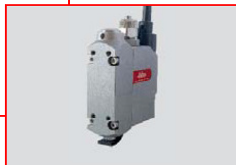
Waterscoring valve from hhs