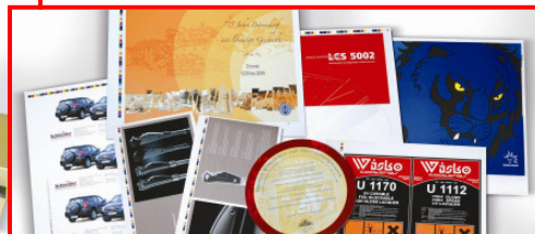
Examples for paperboard containers and print products

The high degree of networking within the Kahle GmbH reflects the progressiveness of the company. Through the CIP4-compatibility of the prestigeFOLD NET 52, a complete network from the pre-press stage to the folding machine has now been realised.